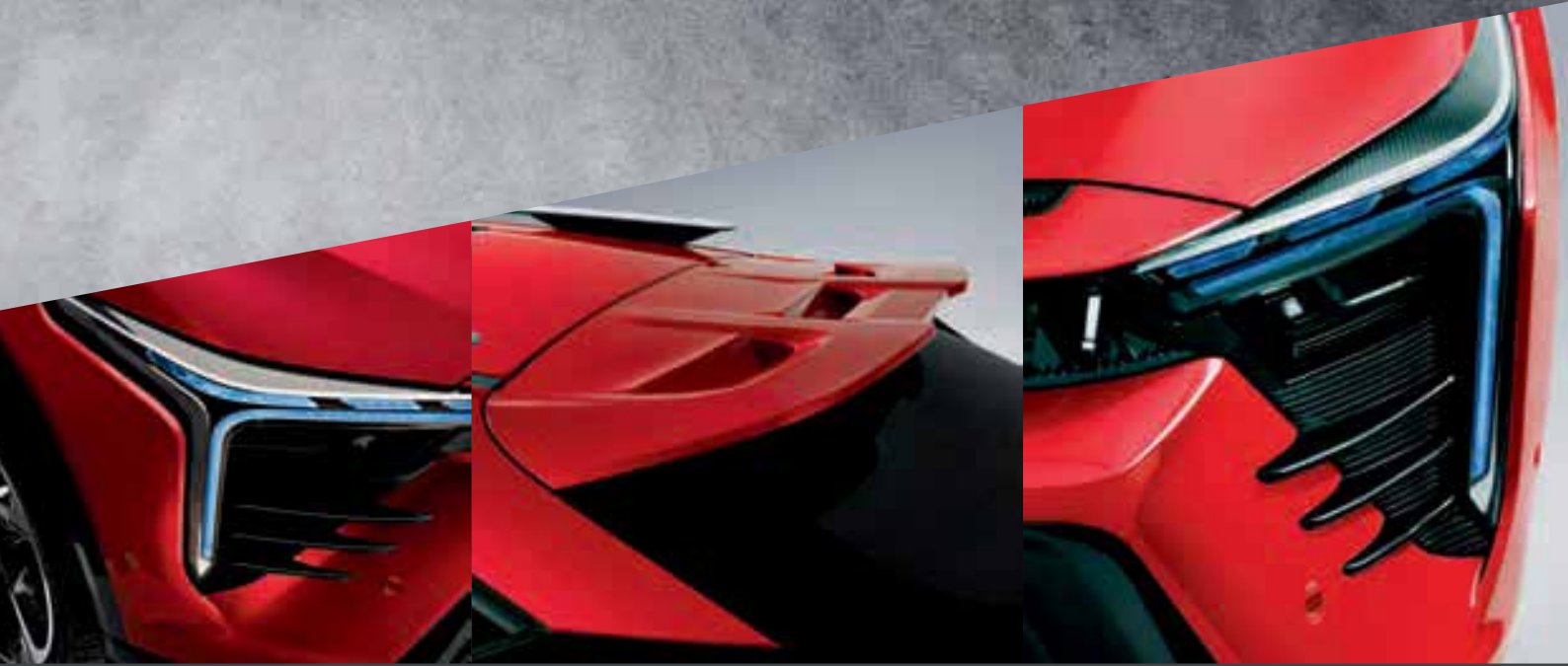
Dagger-axe type 2.0 split headlight مصباح أمامي من نوع Dagger-axe 2.0